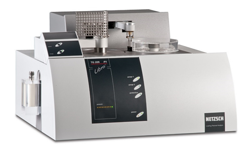
Figure 1. The NETZSCH TG 209 F1 Libra configured with the heated off-gas assembly.

The Libra's heated adapter was connected to the transfer line of the Extrel MAX300-EGA. The interface is differentially pumped for rapid clearing and heated to 200°C to prevent condensation; it provides a low volume, chemically-inert sample path from the TGA all the way into the mass spectrometer's ionizer.