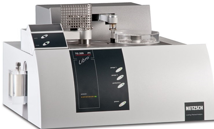
Figure 1. The NETZSCH TG 209 F1 Libra configured with the heated off-gas assembly.

The Libra's heated adapter was connected to the transfer line of the Extrel MAX300-EGA. The interface is differentially pumped for rapid clearing and heated to 200°C to prevent condensation; it provides a low volume, chemically-inert sample path from the TGA all the way into the mass spectrometer's ionizer.