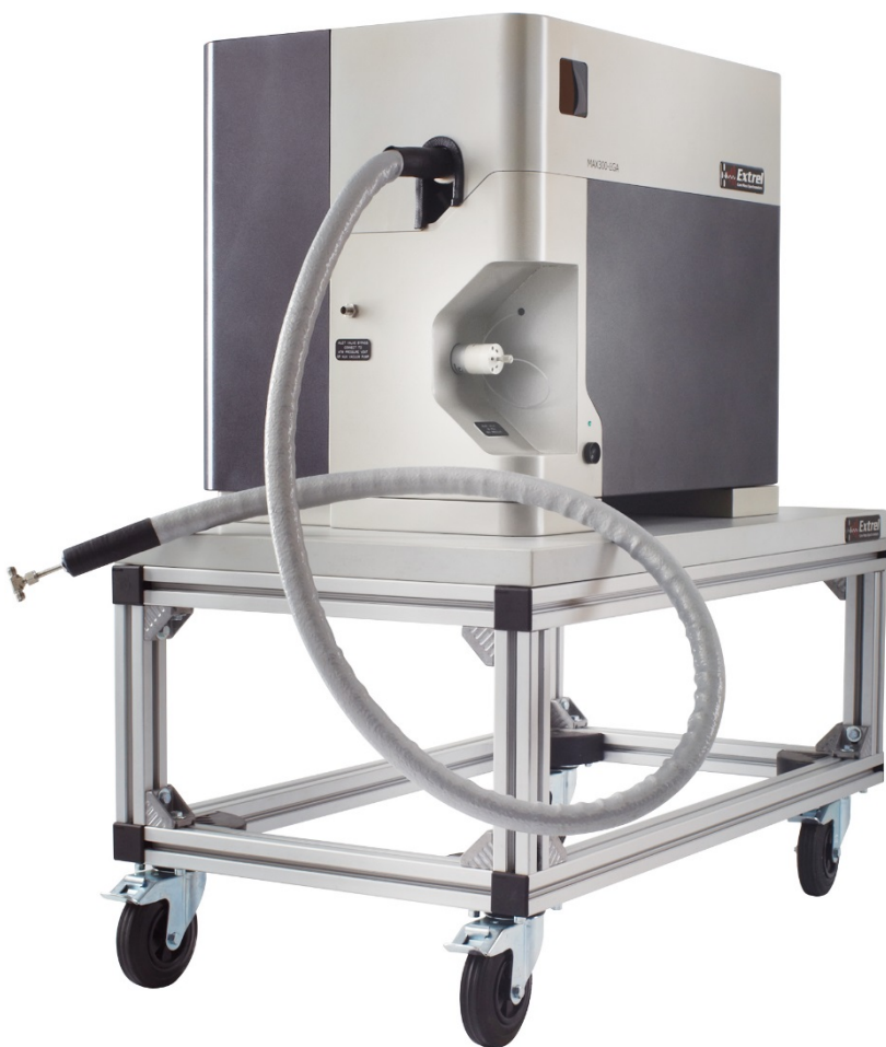
Figure 2. The MAX300-EGA, a quadrupole mass spectrometer optimized for evolved gas analysis.

The MAX300-EGA is a quadrupole mass spectrometer optimized for evolved gas analysis in a laboratory setting. It is capable of scanning from 1-500 amu and features the Extrel 19 mm mass filter for high analytical repeatability and long term stability. The Questor5 software allows the system to perform qualitative analysis for sample characterization, or quantitative analysis, measuring concentrations from 100% down to 10 ppb. In addition to the transfer line, a MAX300-EGA is equipped to import a start-of-heating signal from the TGA and can be configured to perform calculations and trend data, or output the data for viewing and manipulation on a different platform.