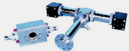
Mid-IR ATR Diamond Probe