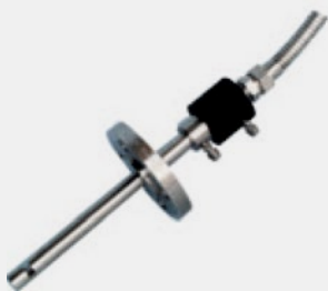
FT-NIR Cross-Line Probe