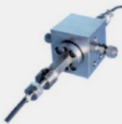
FT-NIR Immersion Probe