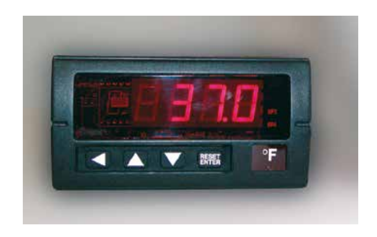
Digital display panel meter provides power and display; relays are optional.