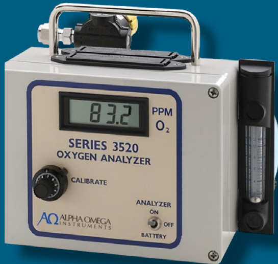
Product shown with optional flow meter and pressure regulator