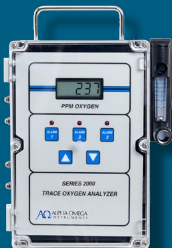
Product shown with optional flow meter