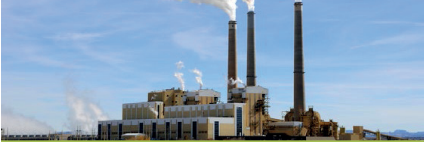
Fig. 2 Coal-fired power plant

gas present in stack emissions and to ensure that steps are taken to guarantee that emissions fall below the specified limits. This may require the emitter to either refine their process, via the use of cleaner fuels, for example, or to add abatement technology downstream of the process to reduce emissions of HCl.