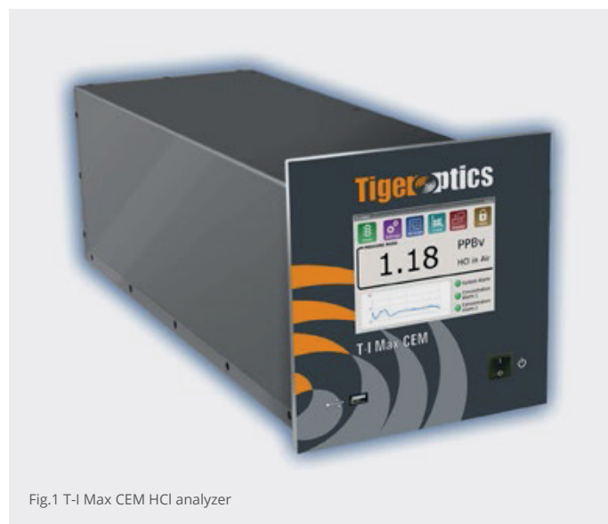
Fig.1 T-I Max CEM HCl analyzer

and emitted with other by-products. In addition, industrial processes emit HCl as a result of chlorides present in raw materials that are converted to HCl during production. In cement production, for instance, raw materials, including calcium carbonate, silica, clays, and ferrous oxides, all contain chlorides, resulting in generation of HCl.