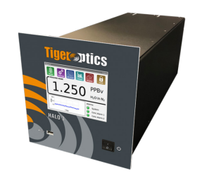
CRDS for Corrosive, Rare, and Fluorinated Gases HALO 3™