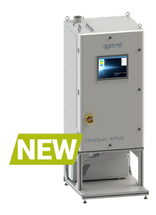
Atmospheric Pressure Mass Spectrometers for Real-Time, ppt-Level, Multi-Impurity Analysis VeraSpec™ APIMS