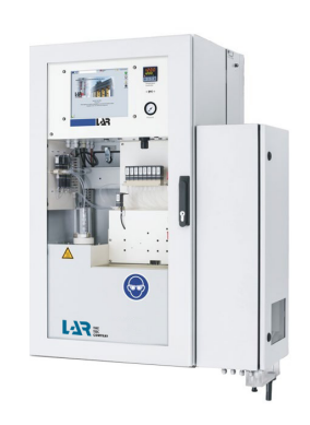
Water Analyzers for Pure and Process Water Applications QuickTOCpurity™