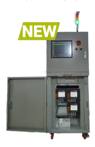
Next-Generation AMC Sampling System Monitor Gases in SEMI & HB LED Environments Multi-Max AMC™