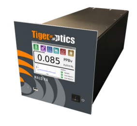
ppt-Level CRDS Trace Moisture Analyzer HALO KA H₂O™