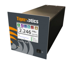
CRDS for ppt-Level H<sub>2</sub>O in pure NH<sub>3</sub> ALOHA+ H<sub>2</sub>O™