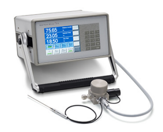
Chilled Mirror Dew Point Meter and Humidity Generators MODEL 473™