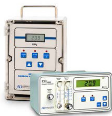
Percent and Trace Oxygen Analyzers, and Oxygen Deficiency Safety Monitors Series 2000™ and ZRO2000™