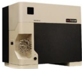
Laboratory Mass Spectrometer for Real-Time ppb-Level to 100% Compositional Analysis of Glovebox Gases MAX300-LG™