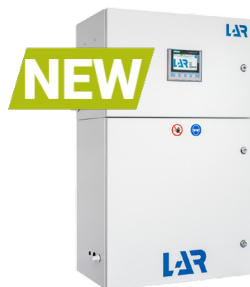
TOC Water Analyzer for Municipal and Cooling Water Applications QuickTOCeco™