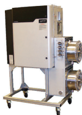
Industrial Mass Spectrometer for Environmental Health and Safety MAX300-AIR™