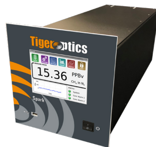
CRDS Analyzer for UHP Moisture in Air Spark™