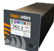
CRDS Trace Gas Analyzer for ppb-Level Detection of H 2 O, CH 4 , CO, CO 2 and C 2 H 2 Spark™