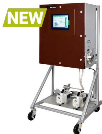
Real-Time, Multi-Stream Mass Spectrometer Gas Analyzer for Accurate OUR, CER and RQ MGA 1200CS™