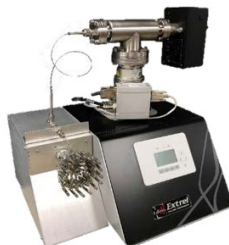
Benchtop Mass Spectrometer for Real-Time ppb-Level to 100% Catalysis, Reaction Monitoring, and Environmental Research MAX-CAT™