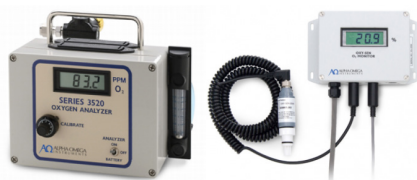
Portable and Fixed Trace-to-Percent Oxygen Monitors Series 3520™ and OXY-SEN™