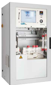
TOC Water Analyzer for Harsh Wastewater Applications QuickTOCultra™