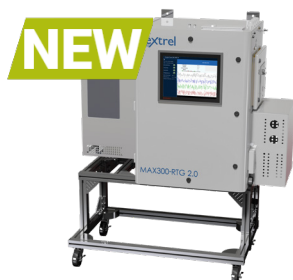
Industrial Mass Spectrometers for Real-Time, Multi-Stream Process Control MAX300-RTG™ 2.0