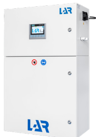
TOC Water Analyzer for Clean Water Applications QuickTOCuvII™