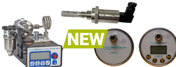
Aluminum Oxide Dew Point Meters and Transmitters with Hyper-Thin-Film Technology for Portable/Fixed/Loop-Powered Applications XDT™ | XPDM™ | HDT™ | LPDT2™