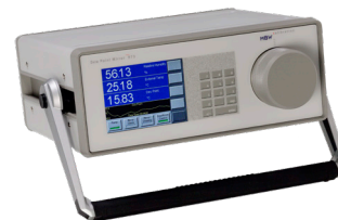
Chilled Mirror Dew Point Hygrometer with Measuring Head for Temperature and RH Measurements MODEL 973™

For a complete range of products, applications, systems, and service options, please contact us at: info@process-insights.com