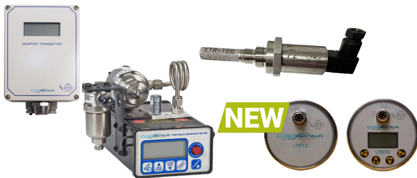
Aluminum Oxide Dew Point Meters and Transmitters with Hyper-Thin-Film Technology for Portable/Fixed/Loop-Powered Applications XDT™ | XPDM™ | HDT™ | LPDT2™