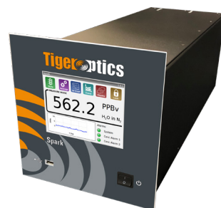
CRDS Single-Species, Trace Gas Analyzer for ppb-Level of H 2 O, CH 4 , CO, CO 2 , Detection Spark™