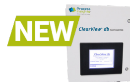
Dual Beam Photometer for Continuous PAT Monitoring ClearView® db