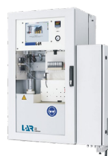
TOC Water Analyzers for Pure and Process Water Applications for Laboratories QuickTOCpurity™