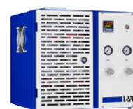
COD Water Analyzer for Laboratories QuickCODlab™