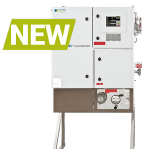
Injection-Style Heating Value Analyzer for Zero Hydrocarbon Emissions for BTU and Flare Control 9610CXc™ Calorimeter