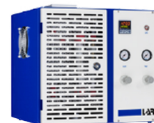
COD Water Analyzer for Laboratories QuickCODlab™