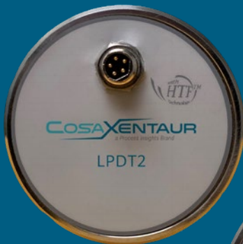
No display version

Ultra-Compact, Loop-Powered Aluminum Oxide Sensor Transmitter -100°C to + 20°C Dew Point