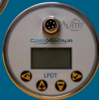
Standard version with display