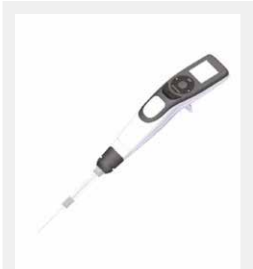
Fig. 1 The innovative eSyringe is part of the scope of delivery of the QuickCODlab and allows the exact dosage of different sample volumes.

The QuickCODlab ensures a high operational reliability and is easy to use. The measured values are output directly to a standard computer and can be quickly and easily processed. The COD measurement is available in just a few minutes.