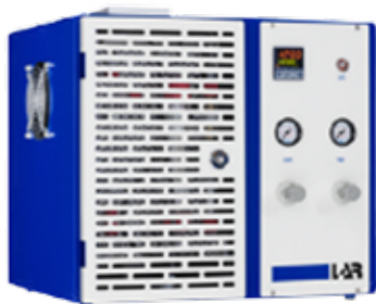
Fast and precise – you can rely on the QuickCODlab.

Environmental Monitoring / Waste Water Treatment / Waste Processing / Pharmaceutical / Laboratory / Petro-Chemical / Refineries / Chemical / Coal And Steel / Power / Airports / Automobile / Paper Manufacture / Breweries / Food Manufacture / Drink Manufacture / Milk Processing / Semiconductor Manufacture