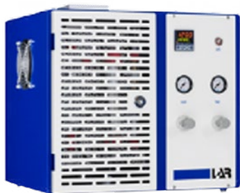
Fast and precise – you can rely on the QuickCODlab.

Environmental Monitoring / Waste Water Treatment / Waste Processing / Pharmaceutical / Laboratory / Petro-Chemical / Refineries / Chemical / Coal And Steel / Power / Airports / Automobile / Paper Manufacture / Breweries / Food Manufacture / Drink Manufacture / Milk Processing / Semiconductor Manufacture