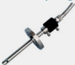
FT-NIR Cross-Line Probe