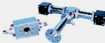
Mid-IR ATR Diamond Probe