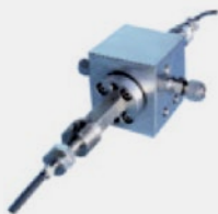
FT-NIR Immersion Probe