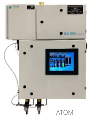
ATOM SLA Analyzer

This report details the field optimization of an ATOM SLA analyzer, demonstrating that through optimization of operating parameters, reliable results with good precision can be achieved with an online analyzer typically not suited for this type of analysis